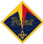
CREAN POLAR AWARD