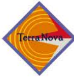
CREAN TERRA NOVA AWARD