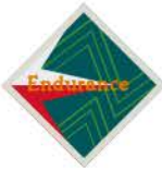
CREAN ENDURANCE AWARD